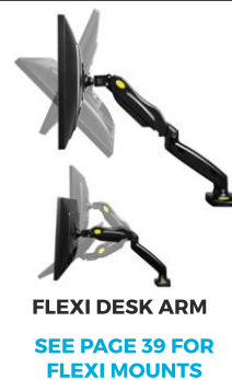
FLEXI DESK ARM SEE PAGE 39 FOR FLEXI MOUNTS