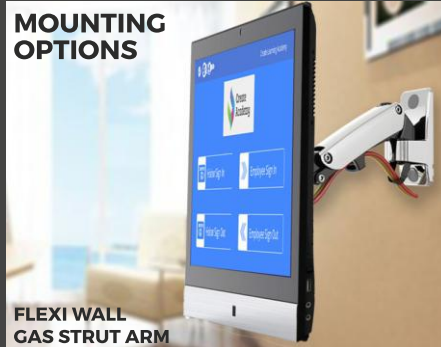
FLEXI WALL GAS STRUT ARM